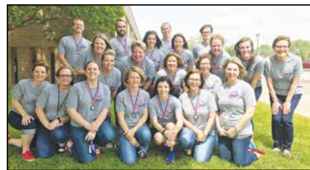
Lake Middle School 200-Milers

Next year the Committee is considering implementing a challenge in the fall focusing on stress reduction and overall mental health.