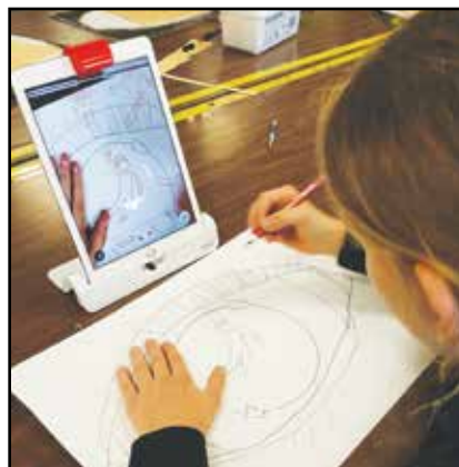
Emma Fulk completes a line drawing.