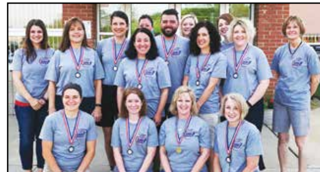
Uniontown Elementary 200-Milers