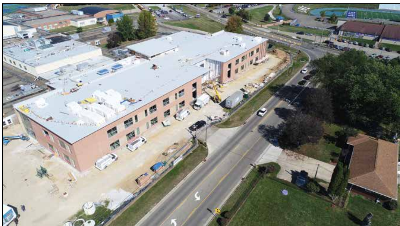
The New Grades 7-12 Building