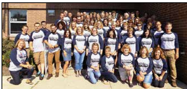
Middle School Staff at the beginning of the school year wearing their “vintage” Farewell Tour shirts.

Over the course of the school year, LMS staff will look for additional activities and invite teachers of the past back to the building to enjoy the LMS spirit one final time.