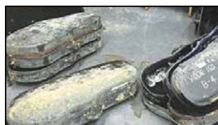
Damaged instrument cases at Vidor Middle School.

After some searching, staff found an outreach program where teachers and students could adopt a classroom in Texas. After seeing pictures of storm damage, staff chose several Texas schools to help: Galloway School in Friendswood, an area outside Houston; Hilliard Elementary in Houston; and Vidor Middle School, located in Vidor. Staff accessed a wish list of items needed for these three damaged buildings. Our students and staff raised $775 from PJ day for these Texas classrooms, and money raised will be used to purchase items on wish lists for these buildings.