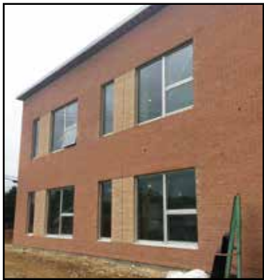
Grades 7-12 south facade.

Lake Local Schools' building projects are underway and progressing on schedule at Lake High School, the new grades 2-6 elementary building, and at Uniontown Elementary.