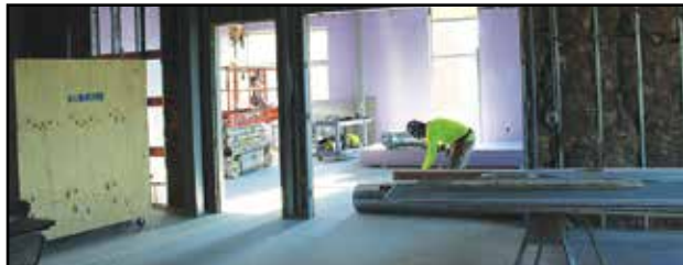
At work in grades 2-6 building.