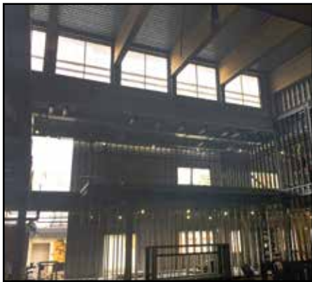
Inside 7-12 building.