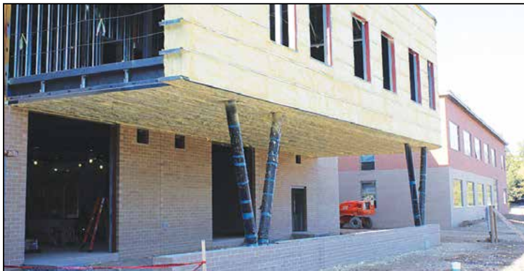
Above three photos show addition of exterior walls and windows to new elementary school.