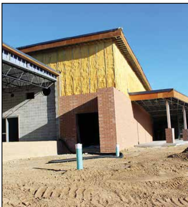
Entrance to new grades 2-6 building.

(see information on pages 2 and 4 inside)