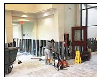
A custodian at the Galloway School cleans the floor after Harvey.

After these classrooms are up and running again, our students will keep in contact with them. We plan on being pen pals, as well as communicating through Skype with students at all three Texas buildings. We are proud of our students for helping other students in need after the devastation of Hurricane Harvey!