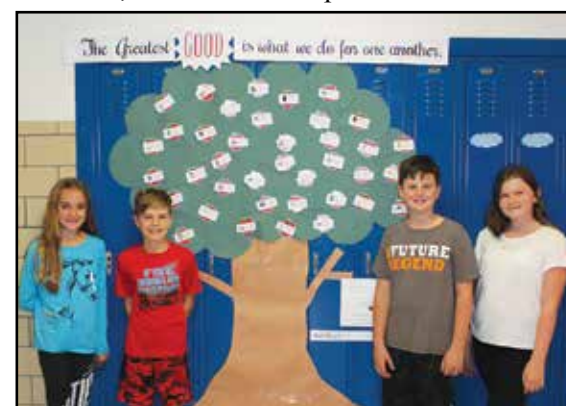
Fifth graders and Giving Tree for hurricane victims.

"Due to Hurricane Harvey, our school flooded three to four feet, taking everything with it. The school has been closed due to massive damage. We (teachers) have not been allowed to enter the school, and have been told that the majority of content in our classrooms has been disposed of. I am saddened to say that many of my students as well have lost their homes. Despite this devastation, I would like to provide a wonderful, fun-filled classroom that is free from