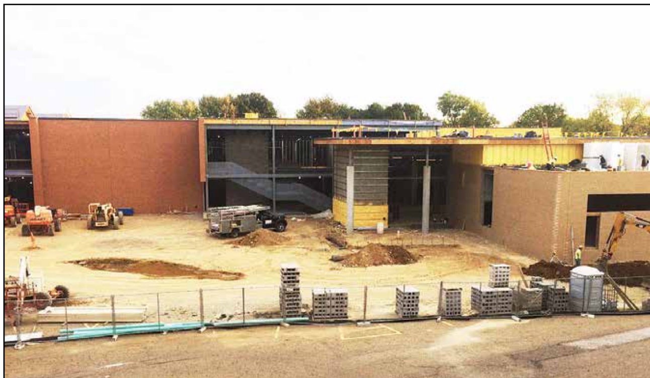
The New Grades 2-6 Building