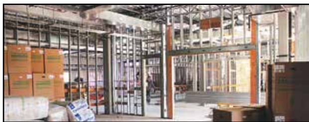
Classroom construction underway in grades 7-12 building.