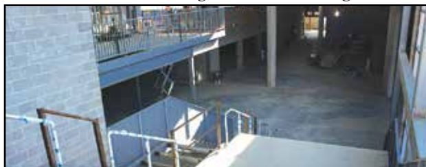
View looking down new staircase inside grades 2-6 building.