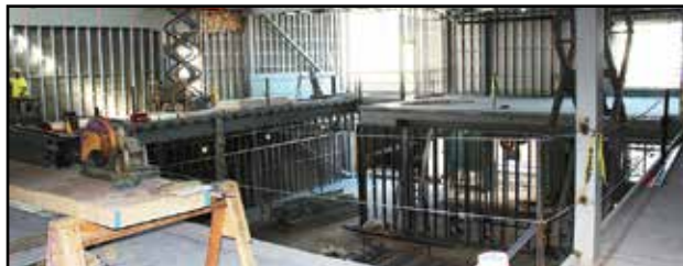
View inside new grades 7-12 building.