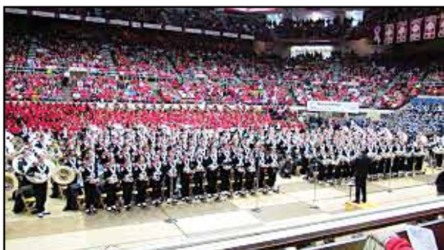
Lake Band will perform at the upcoming Skull Session at The Ohio State University (see p. 2).