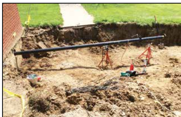
Installation of new gas and water lines at Uniontown.