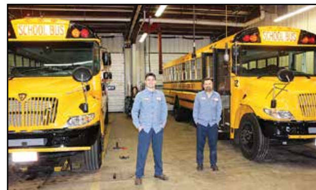
Two new buses acquired last spring will be transporting children this fall.

Note: Anyone interested in viewing the plan can stop at these locations and ask to see a copy. Asbestos inspections are complete in the school buildings every six months, and a major reevaluation is done every three years. Please contact the district Administration office with questions at 330-877-9383.