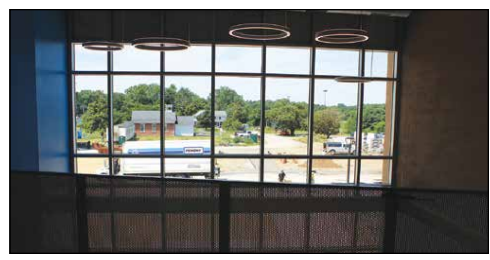
Middle/High School Interior Facing West