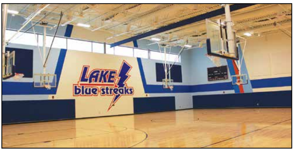
Grade 2-6 Gym