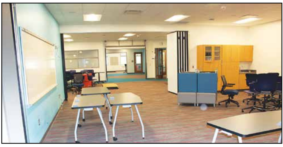
Grade 2-6 Interior