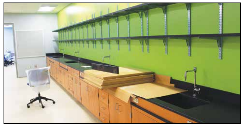
Grade 7-12 Interior