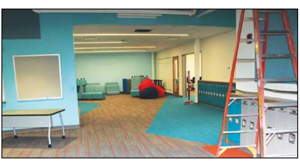
Grade 2-6 Interior