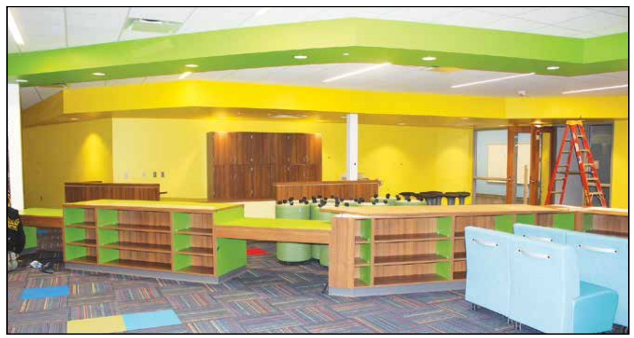
New Media Center