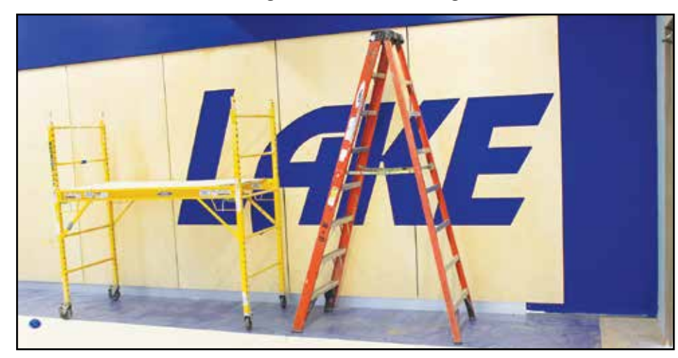
Lake Middle/High School